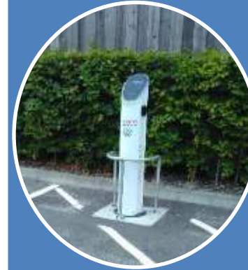
Electric vehicle infrastructure