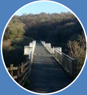
Network of cycle routes