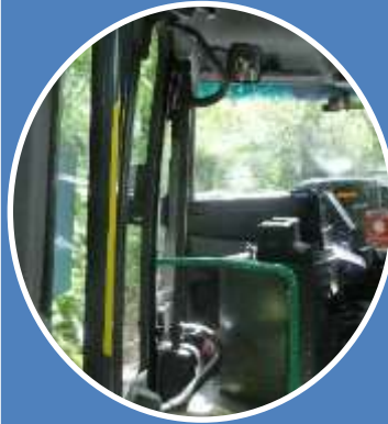
Better bus services